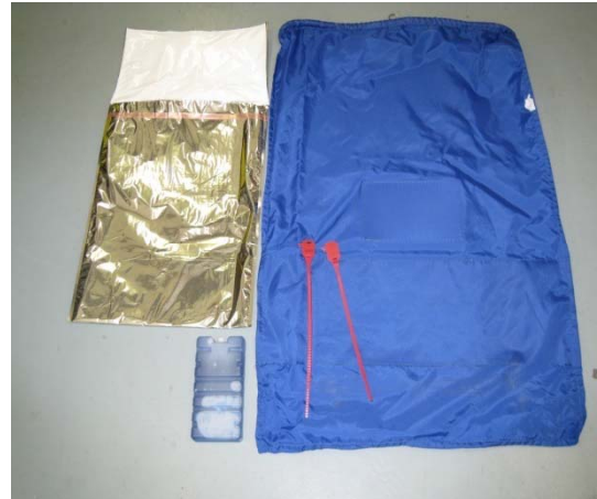
Picture 2: Forwarding materials: isotherm bag; ice packs; security clips; blue carrying bag